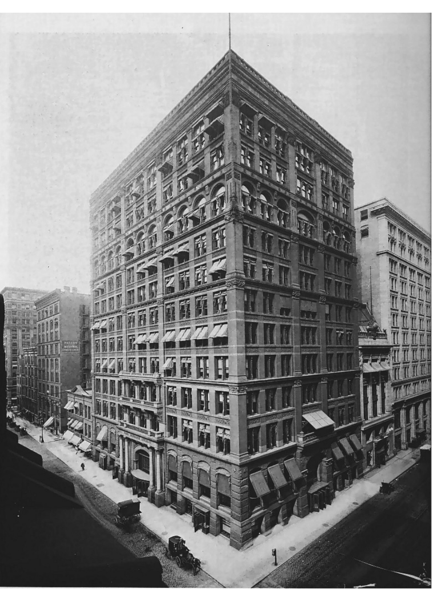
Home Insurance Building northeasts W W. J.W.