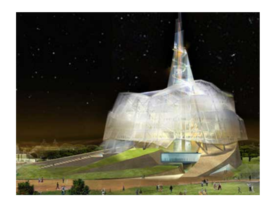
Canadian Museum of Human Rights

Otto von Bismarck in ceremonial Prussian pickelhaube