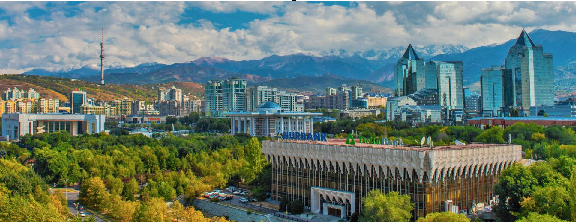
Almaty (Apple city)