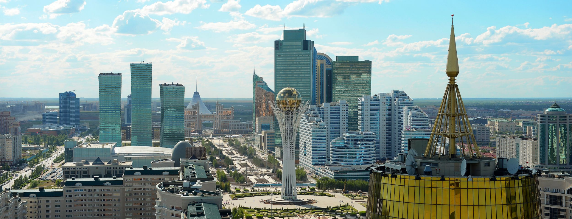
downtown of Astana