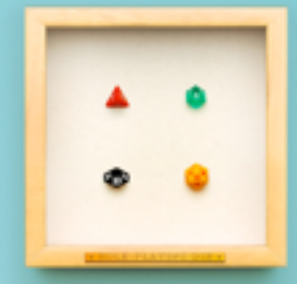
"Entertaining and intelligent."

Now with a new afterword and a bonus short story