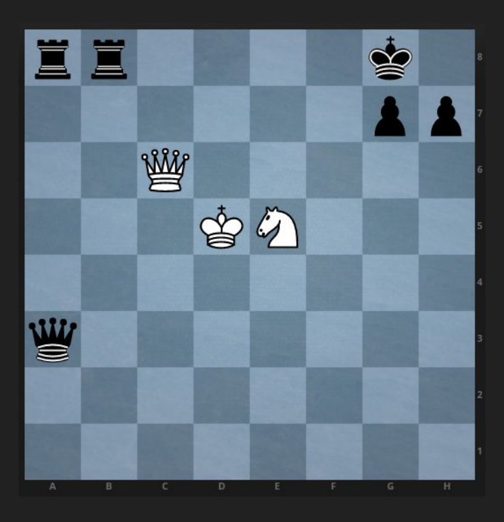
rr4k1/6pp/2Q5/3KN3/8/q7/8/8 w - - 0 1