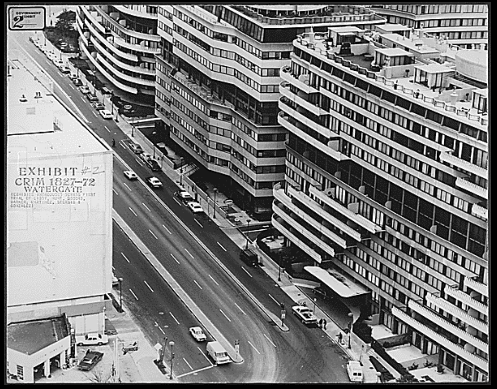
13) On the Proper Methods of Burgling