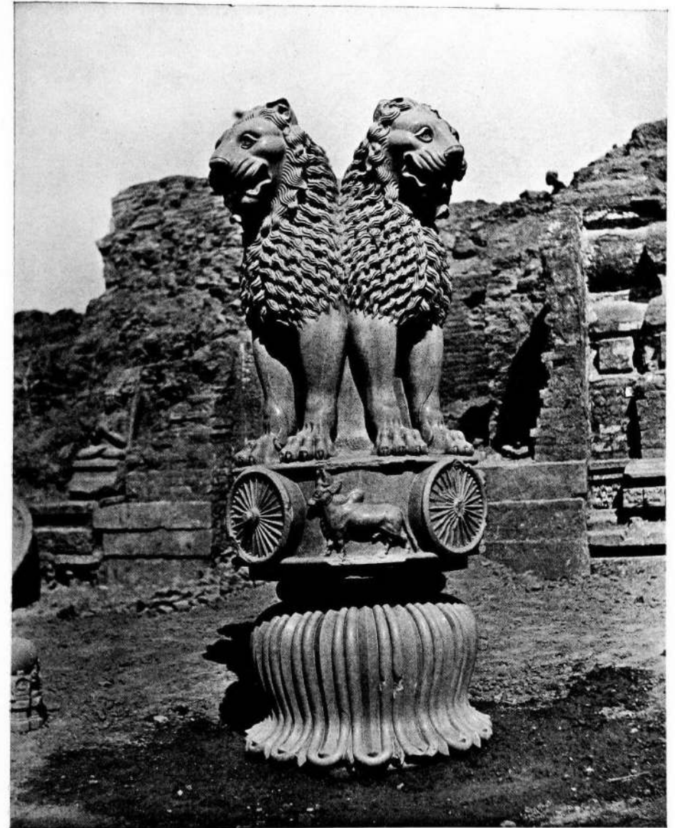
Capital of inscribed Asoka pillar at Sarnath.