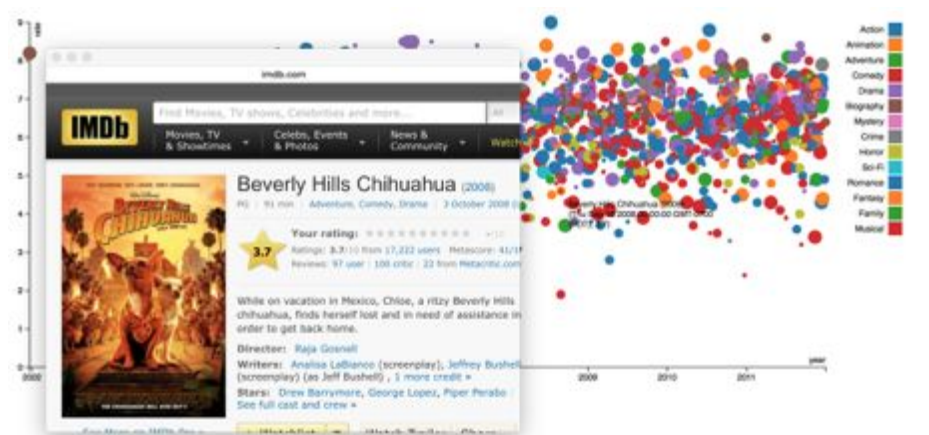
Figure 4 When clicking Link to iMDB, the corresponding iMDB page shows up