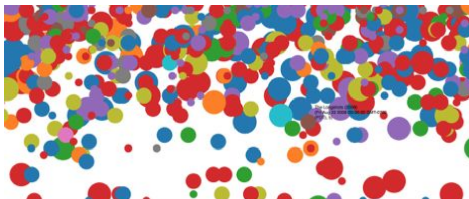
Figure 2 Zooming function in the scatterplot