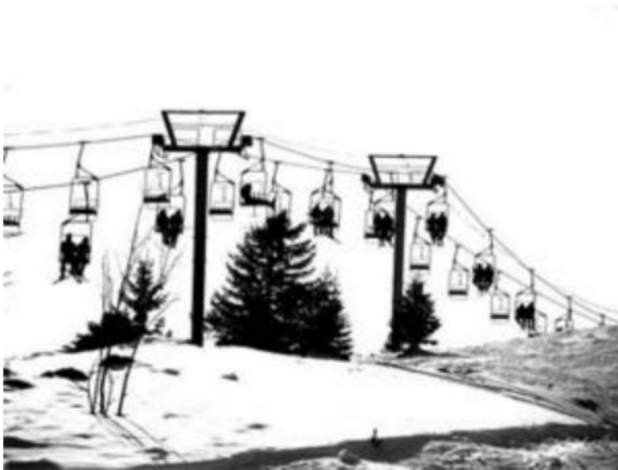
By Ratko Bozovic