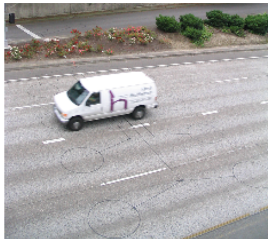
Figure 1. Induction loops on a typical US highway in Portland, Oregon.

We implemented the algorithm in Squeak and Smalltalk/X, two flavors of Smalltalk. The implementation uses a number of general purpose Infopipes, as well as new, traffic-specific Infopipes. The implementation defines about 50 classes. An instance of the application that analyzes a 4-lane highway encompasses more than 100 Infopipes. Different pieces of the application have varied data flow characteristics and may run in separate threads, operating system processes, or on different machines. We believe this application is representative of a modern streaming application.